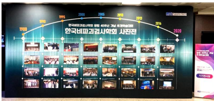
Photos of the past 40 years of KSNT

Celebrating its accomplishment for 40 years of success in contributing to the development and revitalization of NDT industries in Korea, the Korean Society for Nondestructive Testing (KSNT, http://www.ksnt.or.kr ) hosted a very successful Annual Fall Conference on November 5-6, 2020. The International Conference Hall of KOFST in Seoul was the site of KSNT's 2020 Fall Conference. More than 300 attendees including domestic experts from industry and academia participated in the conference where 128 papers were presented. In addition to the professional programme, the Exhibition hall sponsored by more than ten companies was kept open and the conference was followed by the 2020 Annual Business Meeting.