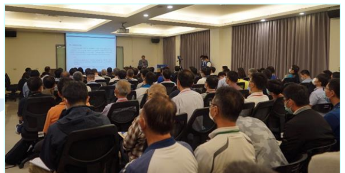
Presentation and panel discussion on the revision of ISO 9712