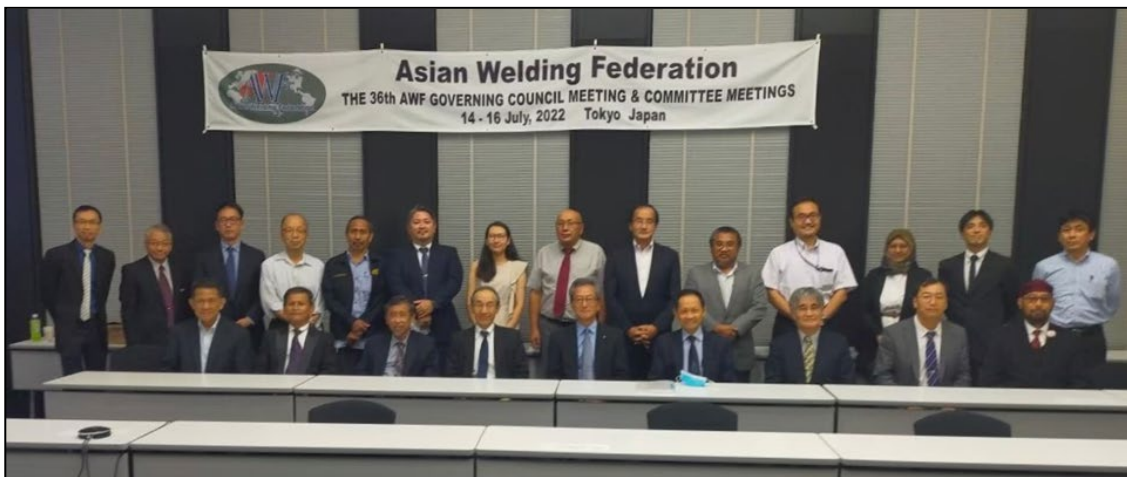
Group photo taken with APFNDT and AWF in person attendees after the session.