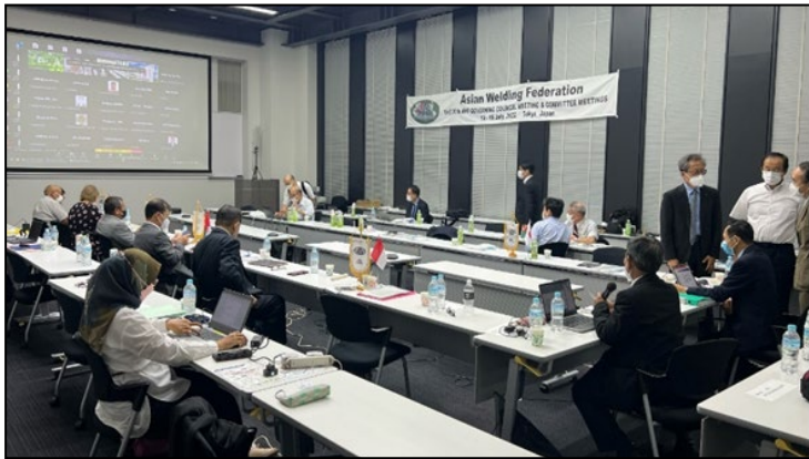
Photo taken during a break between sessions.

On July 14 th to the 16 th , 2022 the Asian Welding Federation (AWF) held its 36 th Governing Council Meeting and Committee Meetings in conjunction with the 75 th International Institute of Welding (IIW) Annual Assembly and International Conference. While the IIW International Conference was held at the Tokyo Big Sight, in Tokyo Japan, the AWF held its meetings beforehand at the Japan Welding Engineering Society (JWES) headquarters in Tokyo, Japan.