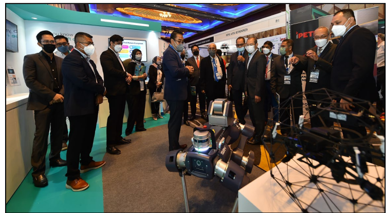
Photos taken from the Conference Exhibition Floor

The pre-conference Technology Showcase held on the 15 th of August, in conjunction with the 6 th MINDTCE, has also received a good crowd to listen and witness Baker Hughes, Waygate Technologies, Advantech Alliance, Evident, and IPetro Services technical presentations. A PETRONAS-sponsored dinner with a pleasant ambience, delicious foods, and entertainment was also held. The dinner was attended by sponsors, exhibitors, and registered participants.