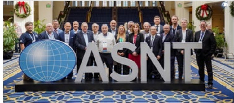
International VIP Guests

The technical program, showcasing the latest research and applications of NDT in a variety of methods and industries, is always a highlight of the Annual Conference. This year’s program featured more than 50 presentations in 14 different session tracks, many of which were streamed live for virtual attendees.