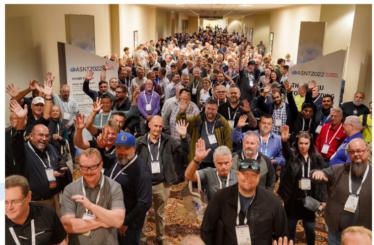
Waiting to enter the Exhibition Hall on opening night.